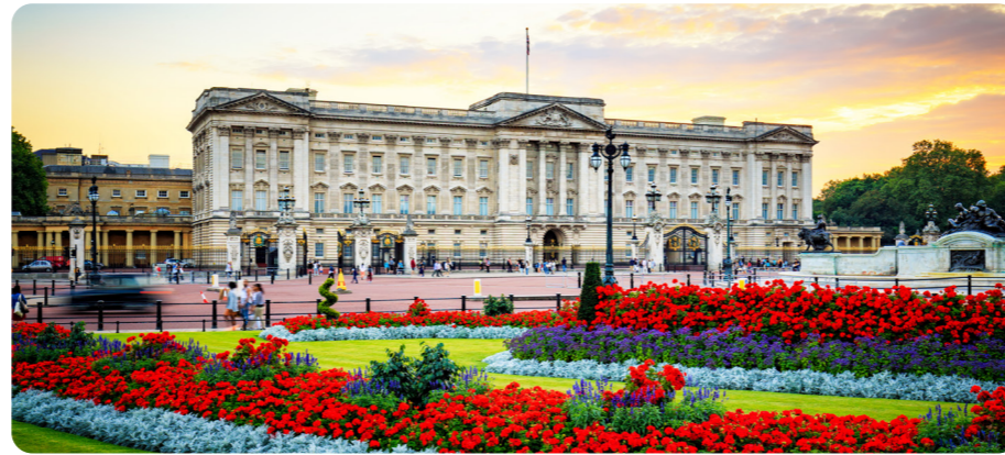
Buckingham Palace is in London, England.

Royal residences include palaces, castles and stately homes. Some of them are used for official royal business. Some are used as holiday or private homes. Many are tourist attractions.