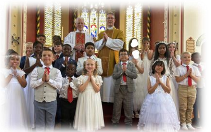
Year 3 First Holy Communion – what a beautiful day!